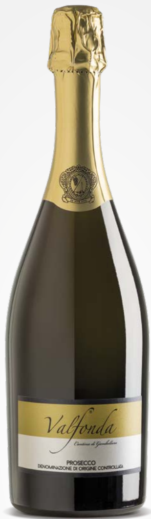
Valfonda PROSECCO DOC SPUMANTE BRUT