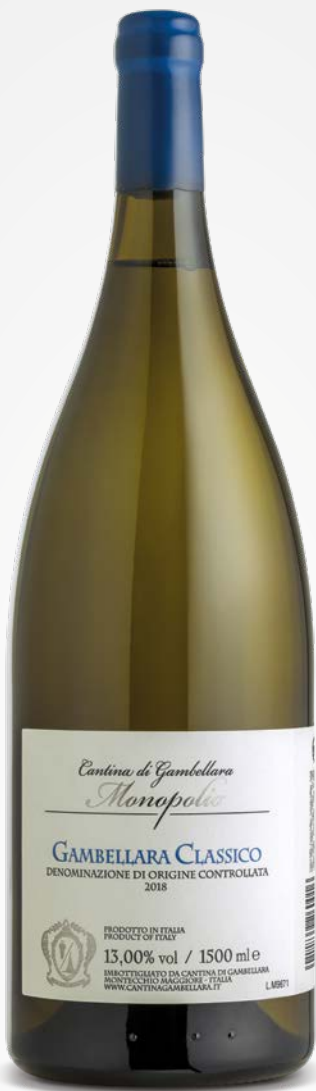
Monopolo GAMBELLARA CLASSICO DOC - 1.5 lt