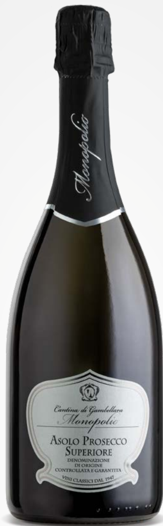
Monopolo ASOLO PROSECCO SUPERIORE DOCG SPUMANTE BRUT